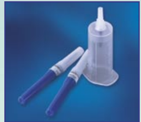
BD Vacutainer™ Luer Adapter