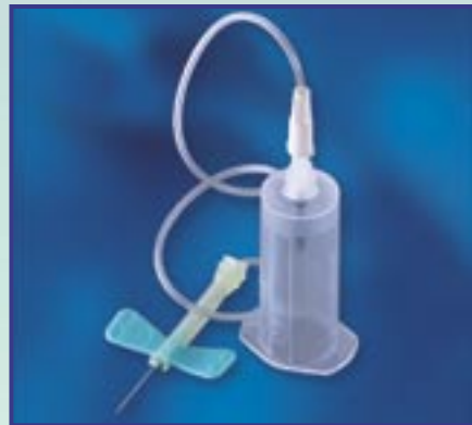
BD Safety-Lok™ Blood Collection Set