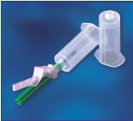
BD Eclipse™ Blood Collection Needle

Compatible with the entire BD Vacutainer Venous Blood Collection System