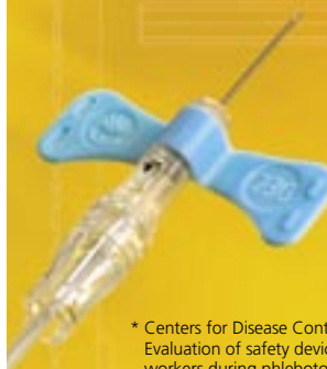
BD Vacutainer® Push Button Blood Collection Set

Visit www.bd.com/vacutainer to learn about the only blood collection system with push-button technology and in-vein activation.