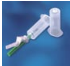
BD Vacutainer® Eclipse™ Blood Collection Needle

This new needle holder is similar in feel to the reusable BD Vacutainer® Standard Yellow Holder. Thus, no change in venipuncture technique is required when transitioning to a single use holder policy. The BD Vacutainer® One Use Holder will be easy to implement into your venipuncture procedures, as it is compatible with the entire BD Vacutainer® Venous Blood Collection System, including BD Vacutainer® Eclipse™ Needles, BD Vacutainer® Safety-Lok™ Blood Collection Sets and BD Vacutainer® Multiple Sample Luer Adapters.