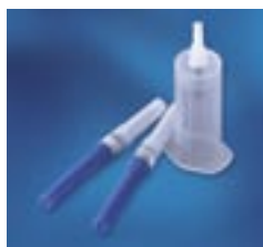
BD Vacutainer® Multiple Sample Luer Adapter

The use of engineering and work practice controls provide the highest degree of control in order to eliminate potential injuries after performing blood draws.