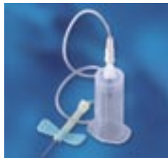
BD Vacutainer® Safety-Lok™ Blood Collection Set