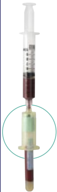
BD Vacutainer® Blood Transfer Device

In these situations, a syringe with an engineered sharps injury prevention feature and safe work practices should be used whenever possible. Transfer of the blood from the syringe to the test tube must be done using a needleless blood transfer device. The BD Vacutainer® Blood Transfer Device (reference number 364880) can help to satisfy this OSHA requirement.