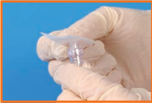
Scrub the hub